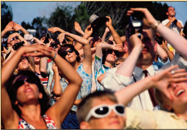
Across from the Kennedy Space Center to watch the launch of Apollo 11 that land on the Moon. Titusville, Florida, USA, July 16, 1969

Recipient of FOTOfusion's Prestigious 2024 FOTOMENTOR AWARD