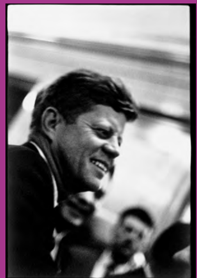
President John F. Kennedy, Salt Lake City, Utah. September 27, 1963